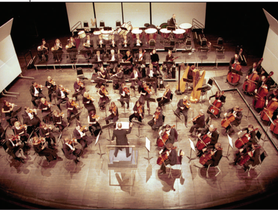
Hemmens Cultural Arts Center

Elgin has been enjoying a tremendous revitalization over the past decade, including the construction of a new police station, and the highly anticipated development of Festival Park. You'll also find the Metra train station nearby which makes life in Elgin so convenient.