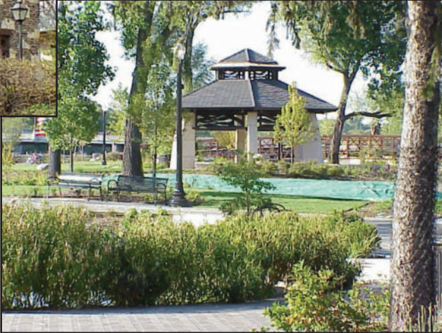
The Pavillion on Walton Island

From the Elgin National Watch Company, to the Spring-Douglas Historic District, the area offers some of the finest historic structures in the state.