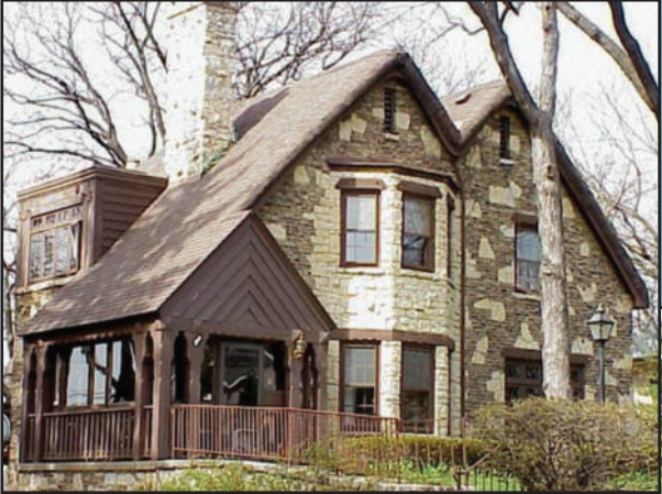
Many homes in Elgin are listed on the National Register of Historic Places.

From the Elgin National Watch Company, to the Spring-Douglas Historic District, the area offers some of the finest historic structures in the state.