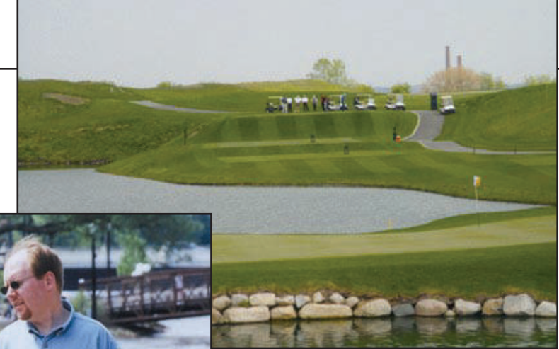
The Highlands Golf Course

Live with miles of scenic walking and biking paths, and some of the finest golf courses the area has to offer.