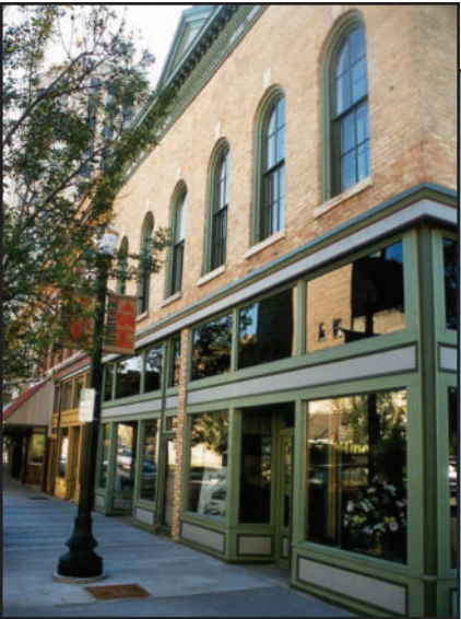
Historic Douglas Street